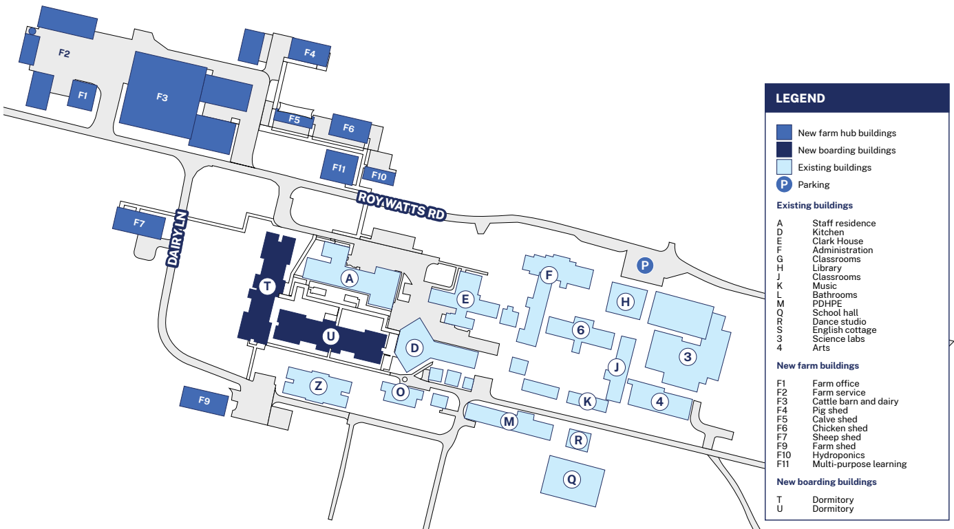
School building layout after project completion