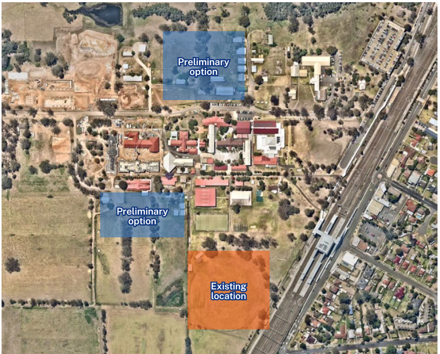
Some preliminary locations being considered for new sports ovals

Further information will be provided to the school community during 2024, as planning advances and details are confirmed.