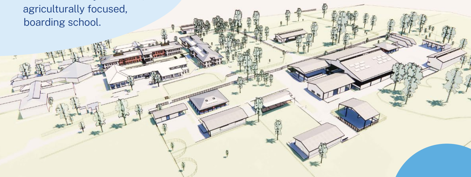
Concept design view looking south-west over new farm hub, across Roy Watts Rd, to the new boarding dormitory buildings

Hurlstone Agricultural High School will proudly remain an academically selective, agriculturally focused, boarding school.