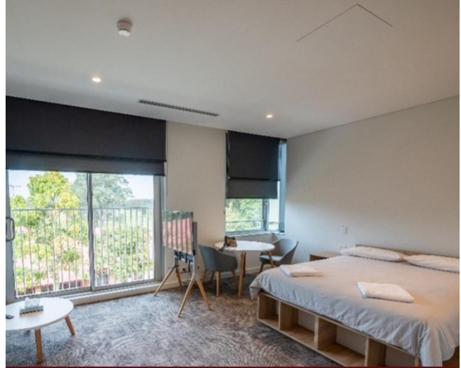
Overnight staff accommodation located on each floor of the student dormitories.