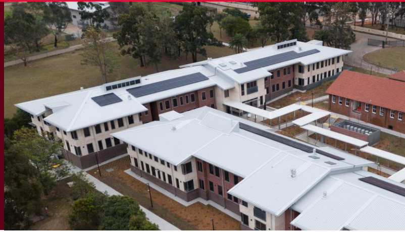
Image caption: The new boarding facilities at Hurlstone Agricultural High School