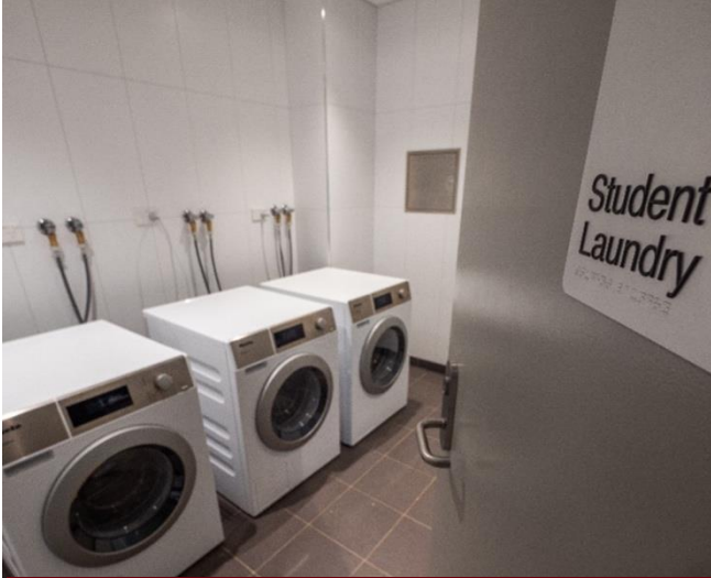
Each building has a student laundry room for washing personal items.