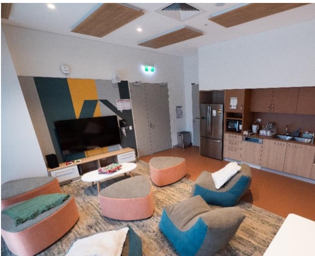
Student common rooms on each floor with kitchenette and adjoining toilet.