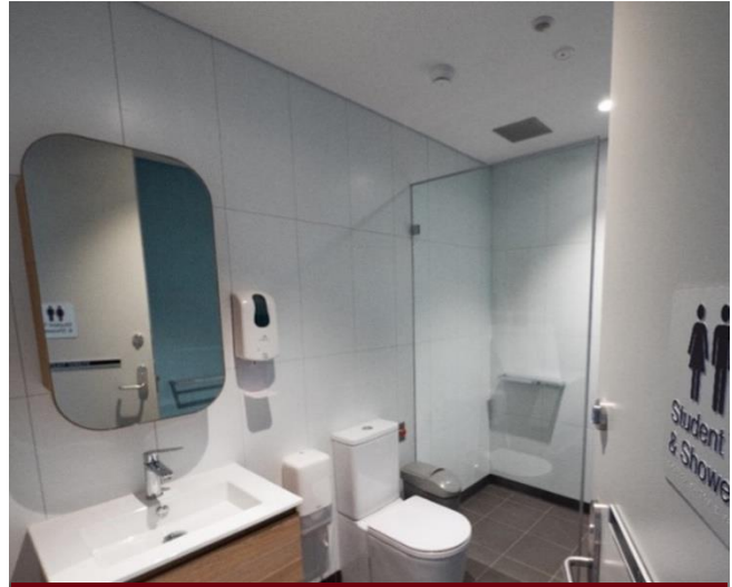
Modern bathroom facilities with private toilet and shower cubicles for students.