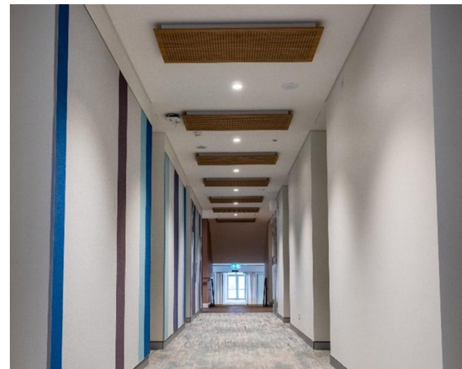
Colours inspired by the natural environment create a welcoming atmosphere.