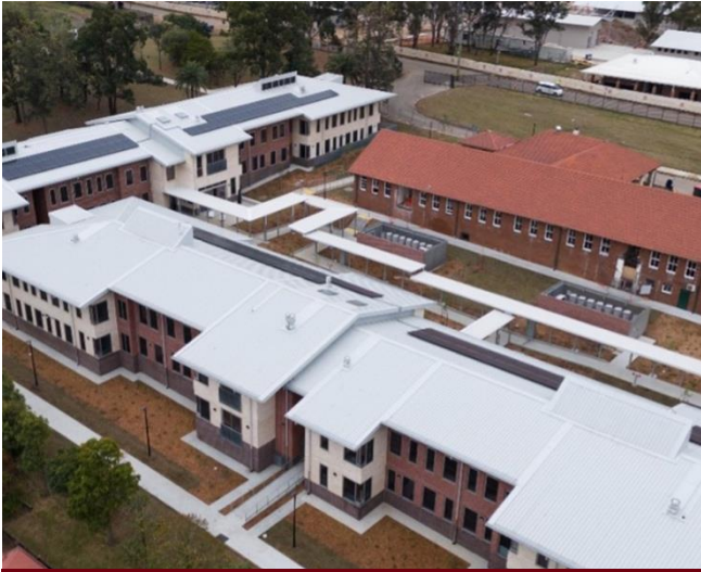
Aerial view of new student accommodation buildings (Block U and Block T).

See below photos of the newly finished facilities.