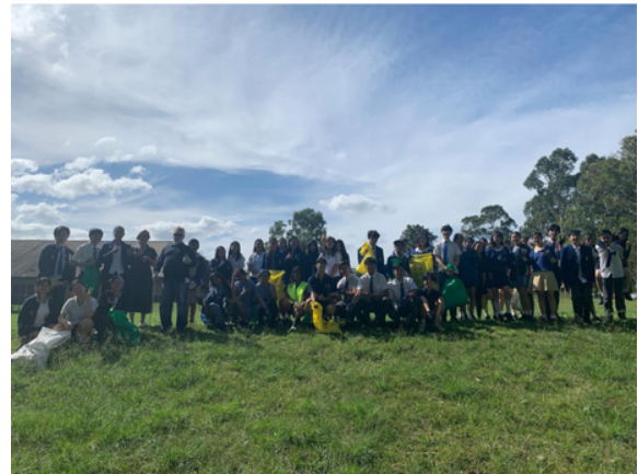
Photo: 2021 Clean Up Australia Day